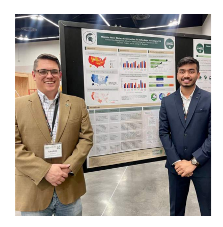
International Mass Timber Conference